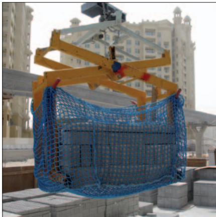
SG – Picture as an example

Fork sleeves with manual turning device ET-D (with additional lifting eye for crane hook), ET-D/B as well as EH 3000 for crane hook operation to be ordered additionally as accessories.